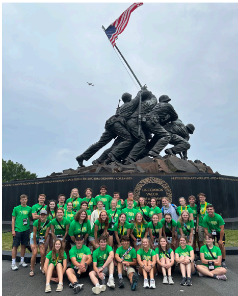
The Iowa Youth Tour delegation visiting the Iwo Jima Monument in Arlington, Virginia.